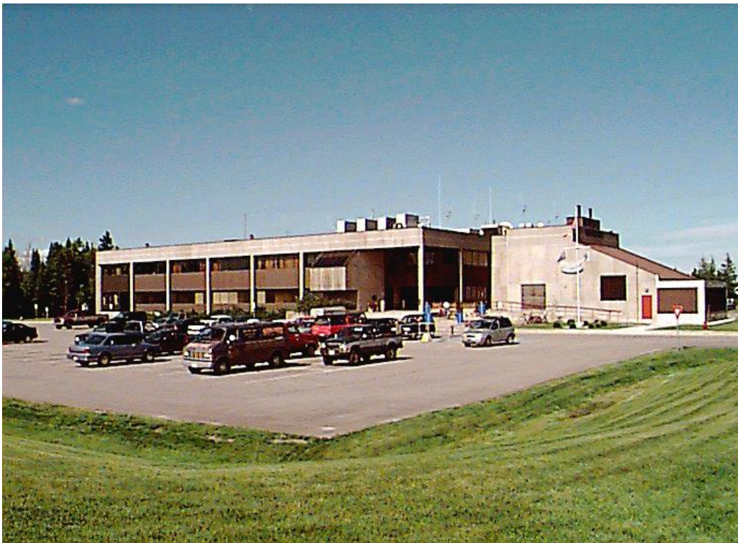
Gander Oceanic Area Control Centre Operations Building